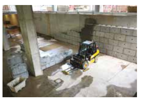
4988 one tonne blocks of reinforced concrete have been used to form the walls of the radiotherapy treatment rooms; this ensures no one outside of the room is exposed to the radiation.