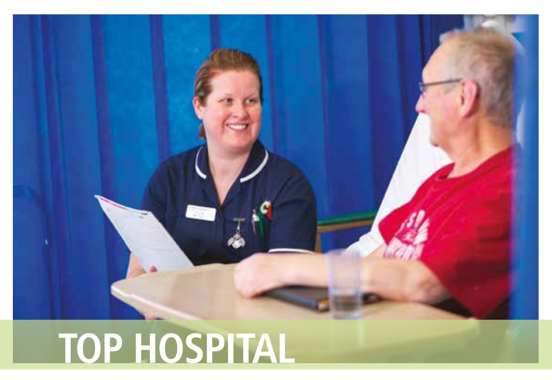
The Clatterbridge Cancer Centre is a UK top hospital according to patient survey.

ur new state-of-the-art hospital will undoubtedly improve the experience of our patients, but it takes so much more to achieve the very best care.