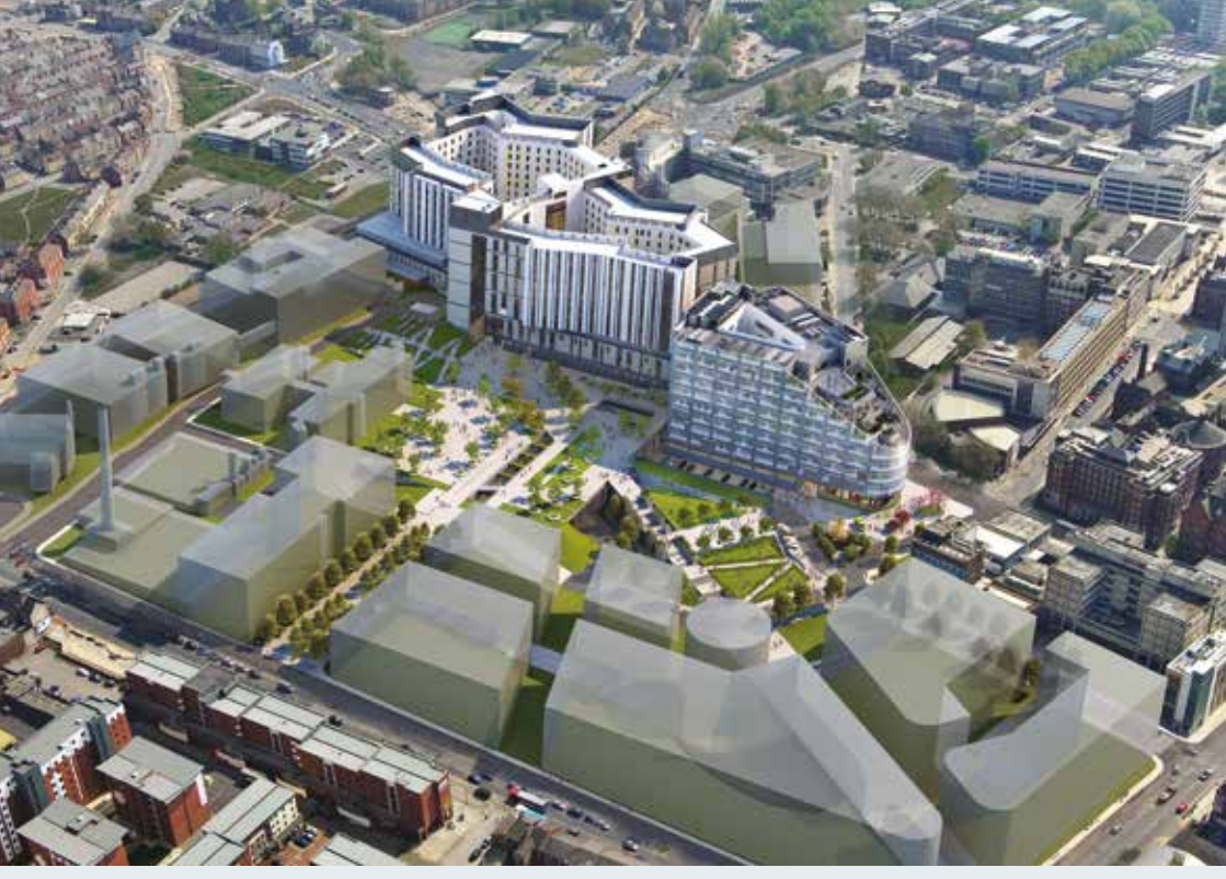
The new hospital will be located on a thriving bio-campus next to the universities and Royal Liverpool Hospital.