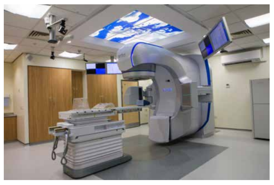
A photograph of a treatment unit

This information is for patients who are going to receive radiotherapy to their whole brain for the treatment of secondary brain tumours. It will explain what to expect when you attend for planning and treatment and details the services that are available to you at The Clatterbridge Cancer Centre.