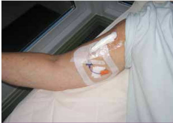
An image of a PICC line when not in use at home

The PICC line needs to be cleaned, redressed and flushed with saline once a week by trained staff from The Clatterbridge Cancer Centre, by district nurses or by family/friends to prevent the line becoming blocked. It is essential to keep the line clean and dry at all times, so when bathing or showering it helps to cover the area. The team will provide a few "shower sleeves" which can be used multiple times to keep the line dry, wrapping the area in