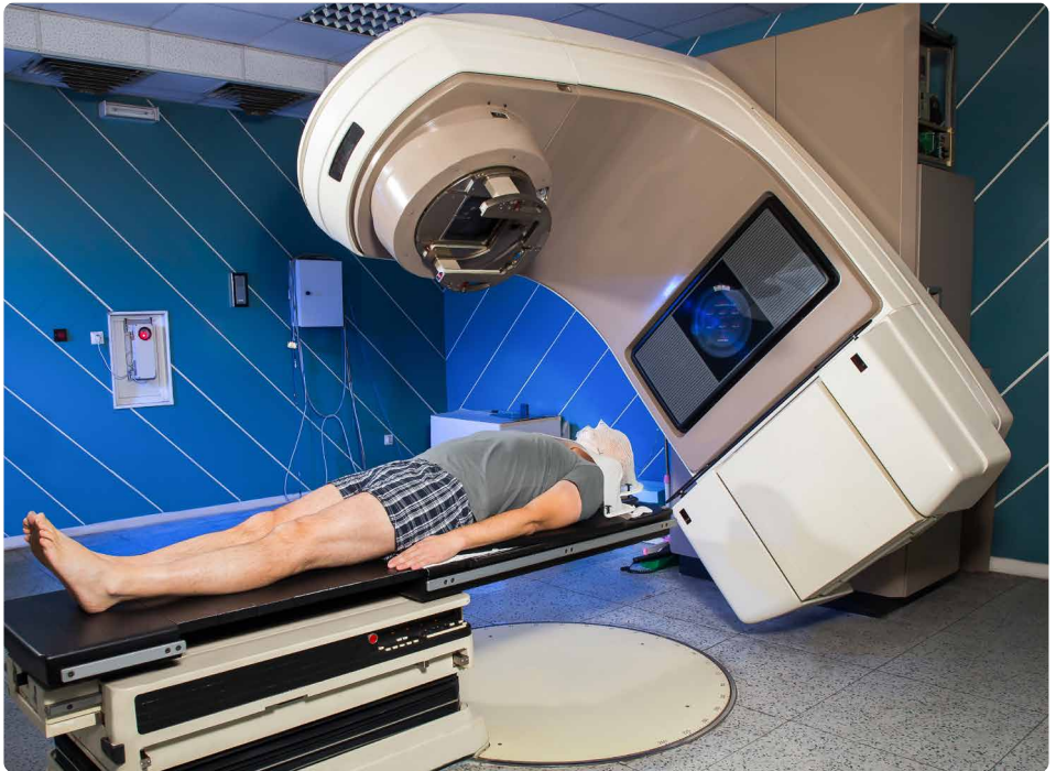
Figure 1. Radiotherapy machine in use

Radiotherapy treatment does not make you radioactive as the radiation passes through your body. It is therefore safe to mix with other people during and after radiotherapy treatment.